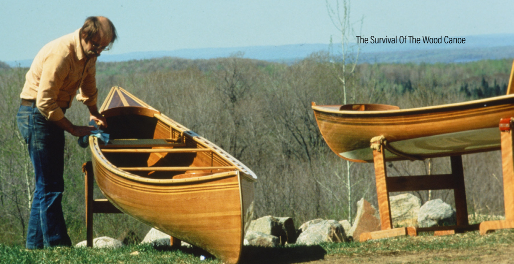
The Survival Of The Wood Canoe