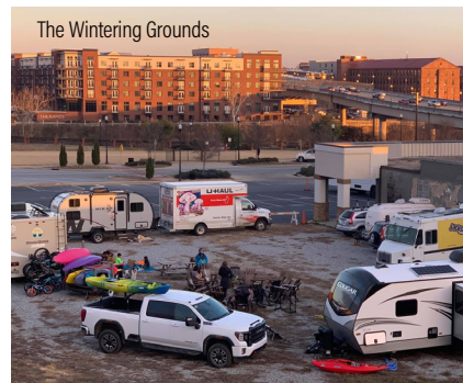
The Wintering Grounds