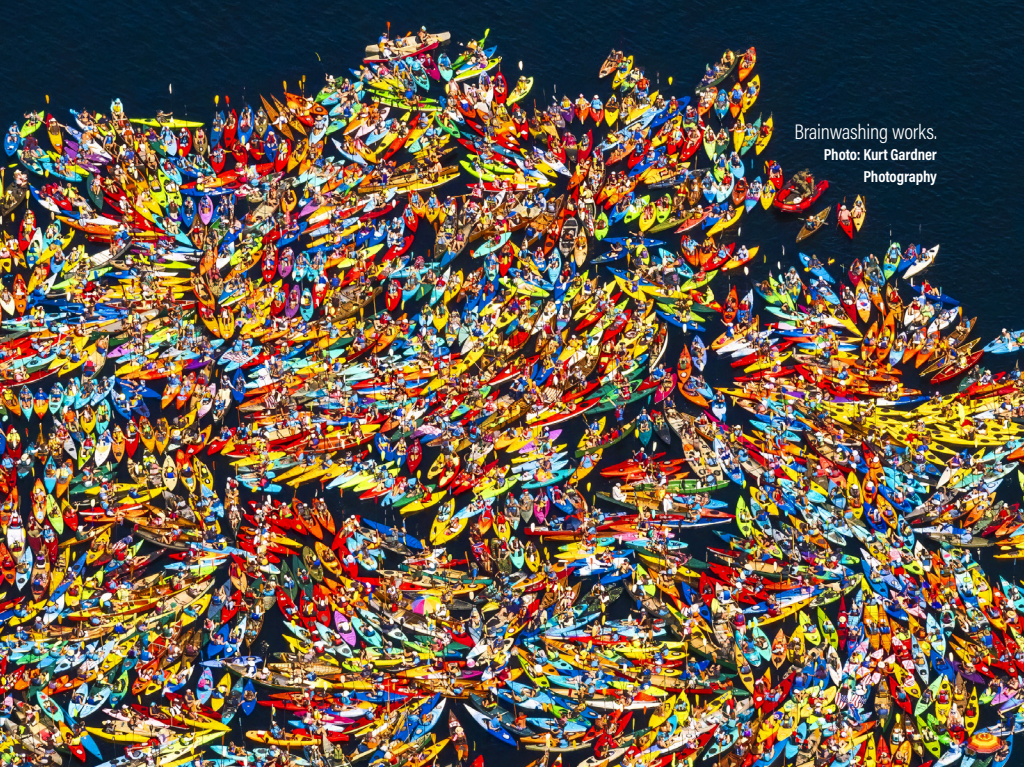
Brainwashing works.