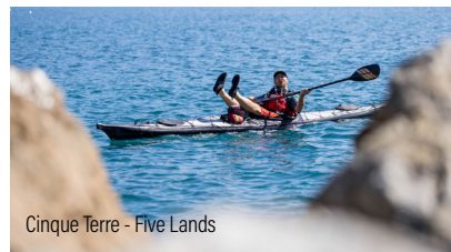
Cinque Terre - Five Lands

Secret passageways to: More fishing through private land in Montana.