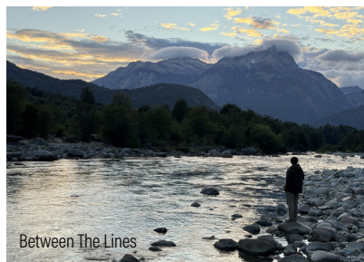
Between The Lines