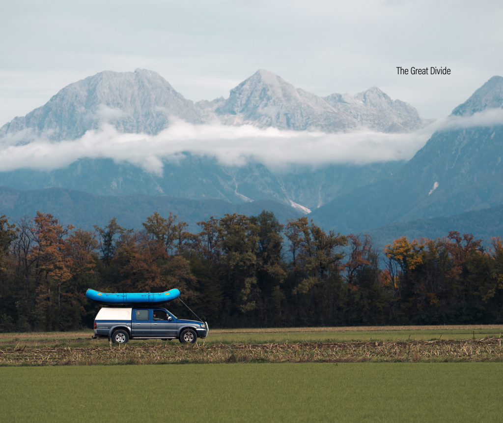
The Great Divide